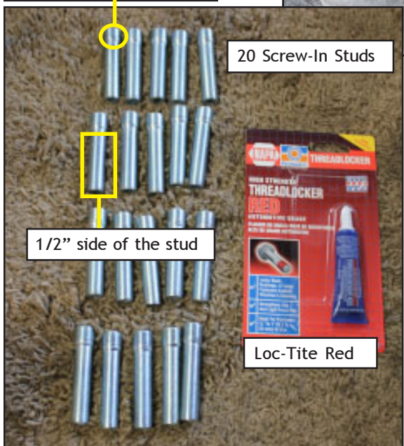
20 Screw-In Studs