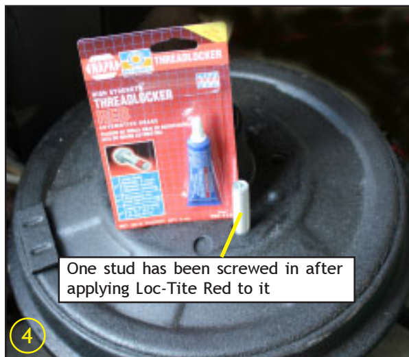
One stud has been screwed in after applying Loc-Tite Red to it

Your kit contains 20 screw-in studs and a tube of Loc-Tite Red. The stud is installed with the 9/16ths end screwed into the brake drum.