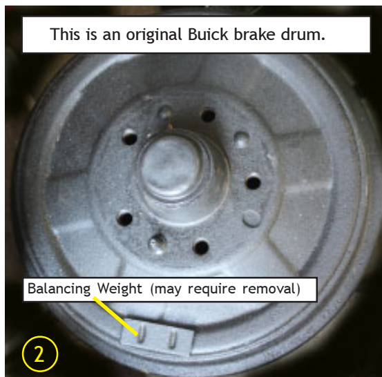
This is an original Buick brake drum.